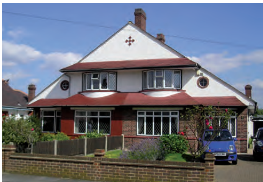
The house on the right retains much original detail but the one on the left has painted brick and a different glazing pattern to the ground floor windows. Minor alterations such as these can spoil a building's distinctive 1930s appearance.