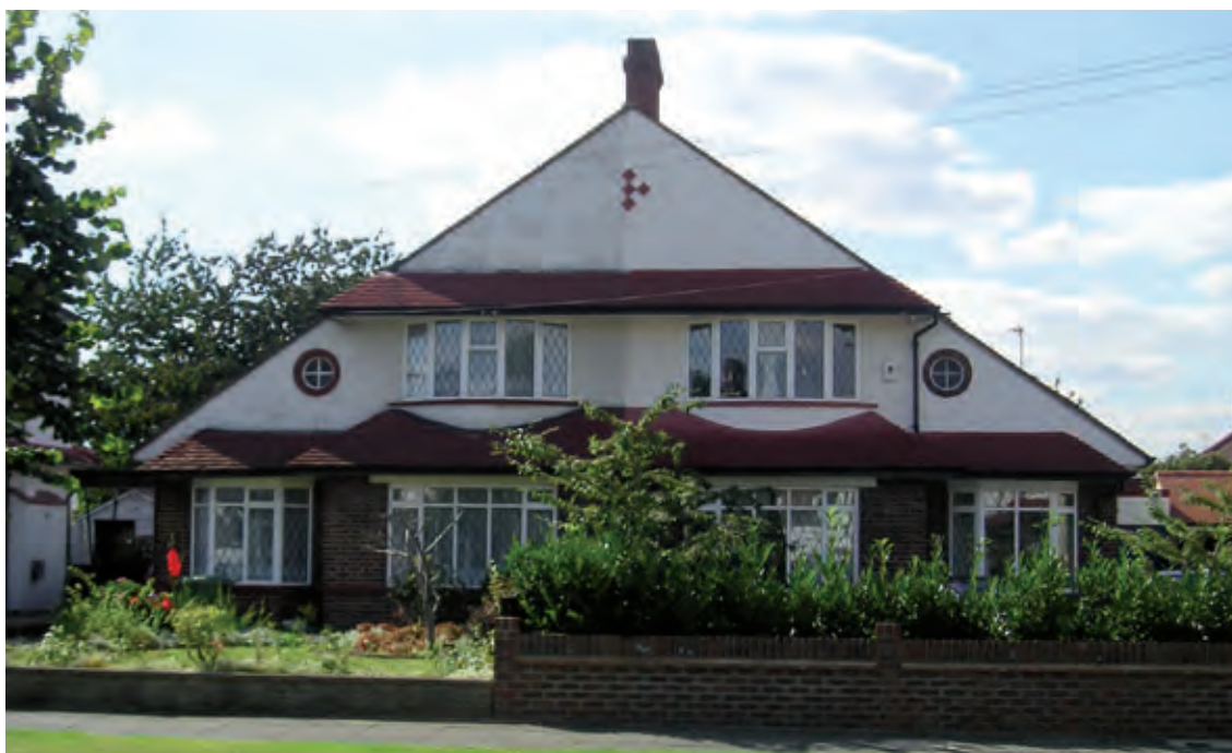
This pair of chalet style semi-detached houses is relatively unaltered externally and retains original features such as symmetrical porthole windows, first floor bowed five light windows and central chimney stack. The low wall on the right is original. Front doors are on the side of the building.