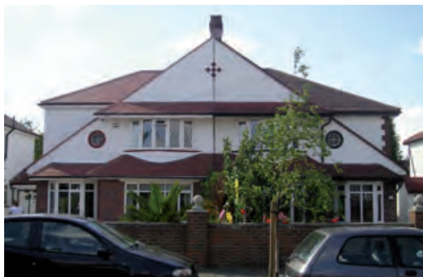
Both halves of this pair have been extended but the strong chalet style roofline has been retained by a significant set-back; symmetry and original detail have been preserved.

7.10 There are 120 individual dwellings in the conservation area, over half of which already have some form of side extension. Of the 56 pairs of semi-detached chalet style houses, only 13 pairs have no significant side extensions and therefore retain their distinctive "A" shape roof profile.