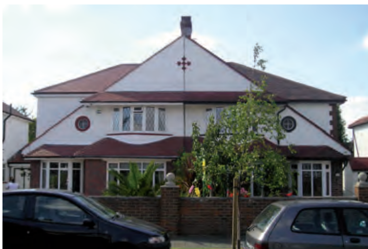
Two extended pairs of chalet style houses. Both are 'balanced' but where one pair retains an A shape roof profile in keeping with the building's original design the other, where the side extensions have not been set back, have a new and different appearance.