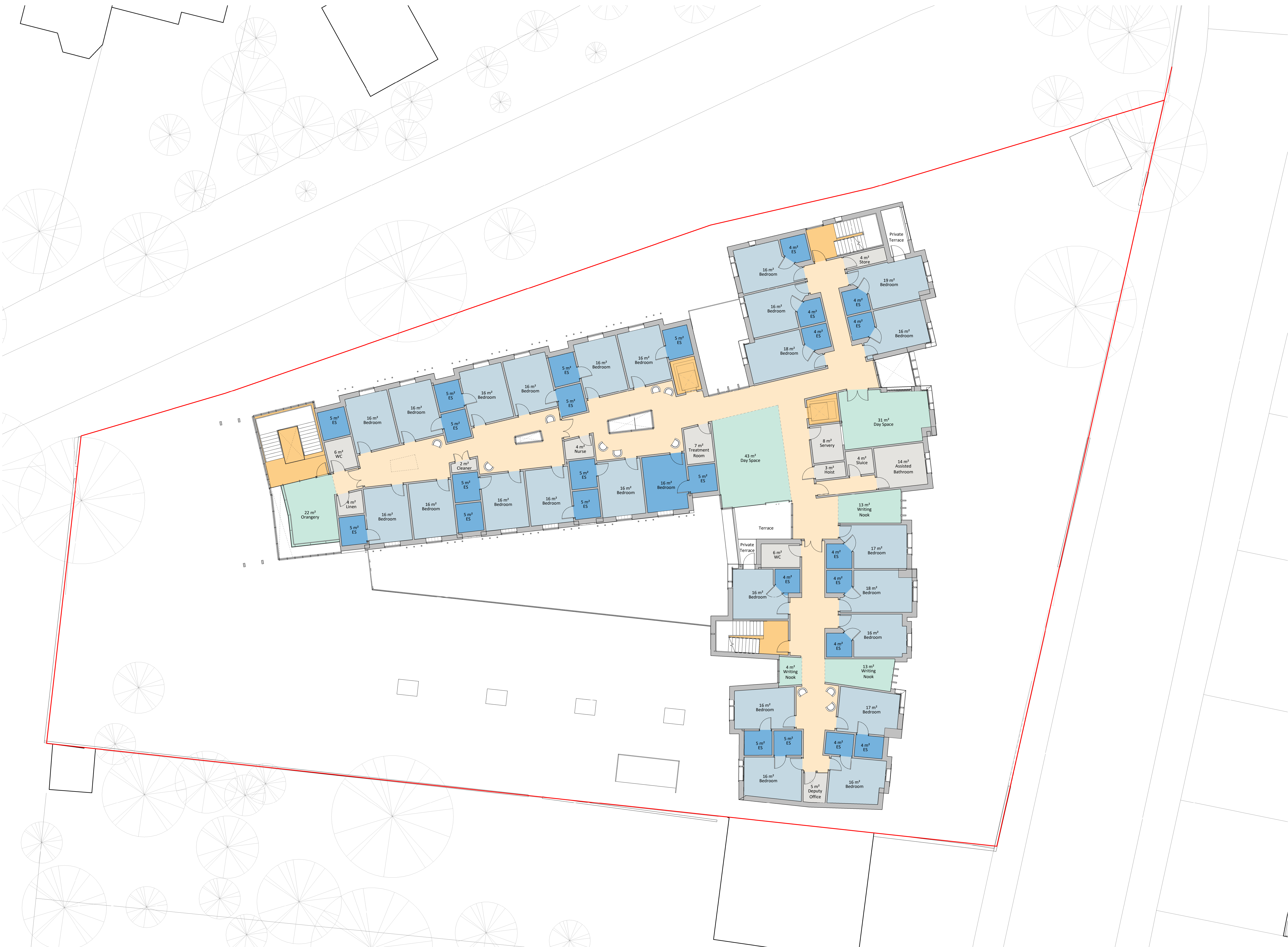
First Floor Plan 1 : 100