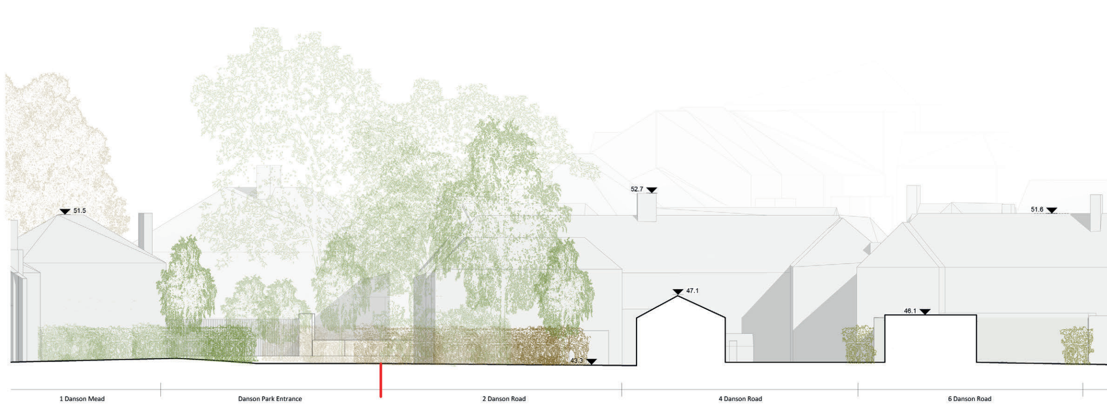
Eisting south elevation 1:200