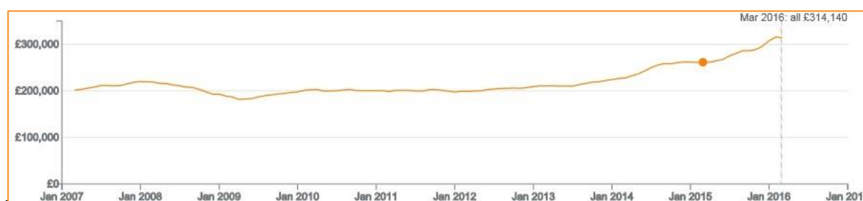
Figure 2: Average house prices in Bexley from March 2007 to March 2016