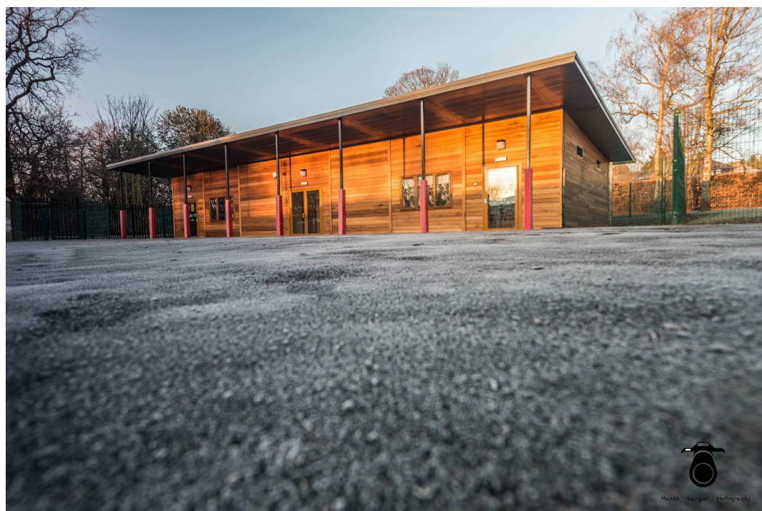
Shenstone Modular completed in September 2018

The planning window for additional primary places is short and can often be affected by external factors. This will frequently mean that schools suitable for expansion will need a temporary solution followed by a permanent expansion once statutory consultation has been completed.