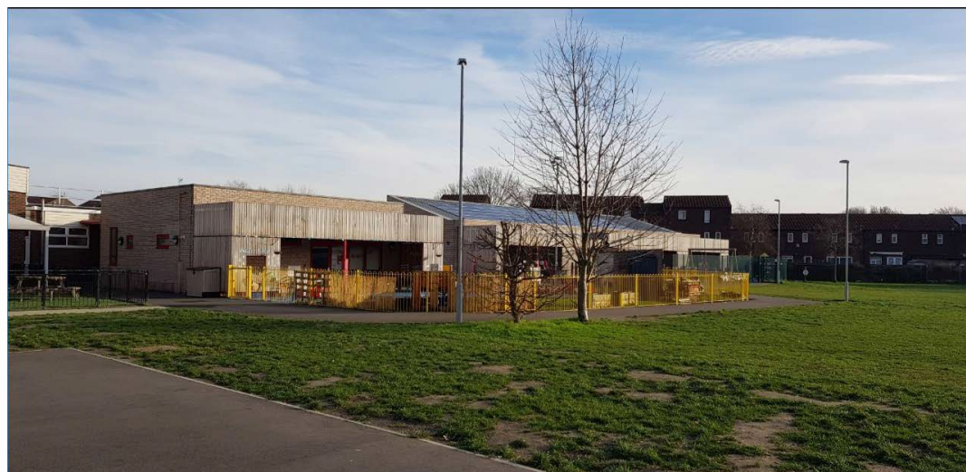
Parkway SEN unit.

The type of AP that is needed to meet demand differs from borough to borough. The provision that boroughs identified being short of (which is also the case at Bexley) includes provision for children and young people with SEMH needs, particularly in Secondary Aged pupils. SEMH is the second fastest growing need within Bexley after ASD.