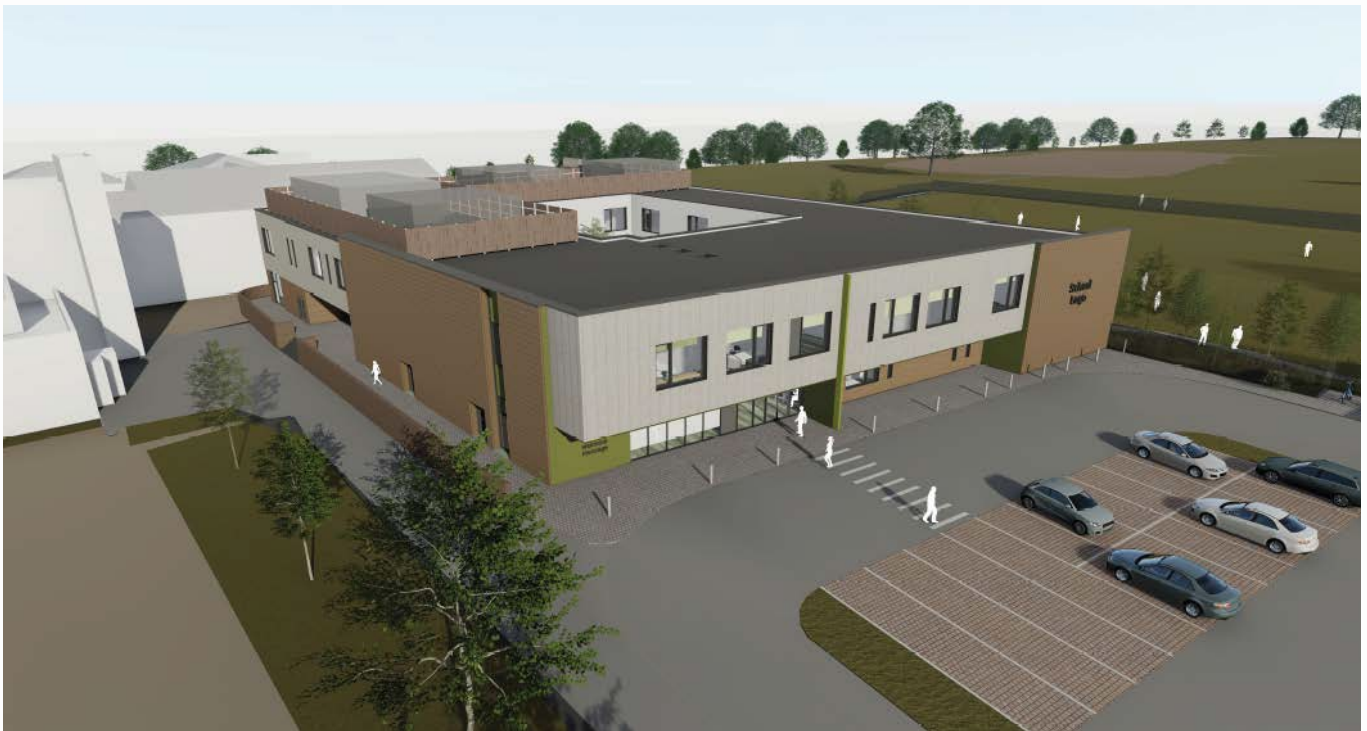
Cleeve Meadow Special Needs Free School, to be delivered by April 2020