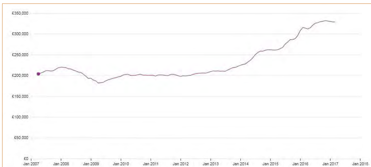
Figure 2: Average house prices in Bexley from March 2007 to March 2016

4.49. The number of people on the housing register had risen steadily over time; however, the figure has risen significantly in this reporting year, from 5,548 people in 2015/16 to 7,011 people at the end of March 2017. Probable reasons for this increase in demand for housing is rising homelessness, changes in migration, a shortage of suitable private rented accommodation, and decreasing affordability.