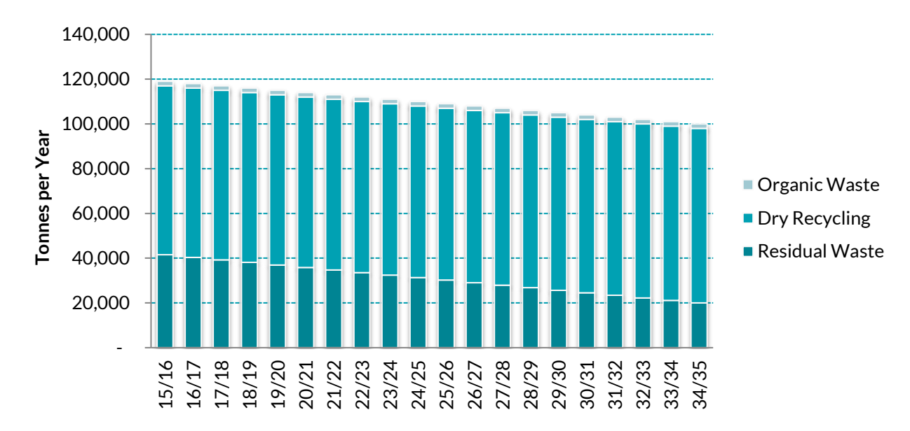
Figure 2: Projected Commercial and Industrial Waste Arisings 2015-35

In overall terms (household and commercial/industrial), Figure 4.3 shows that the total operational waste arising is not expected to change significantly during the development period, with a predicted 3% growth from 215,200 tonnes in 2015 to 222,400 tonnes in 2034.