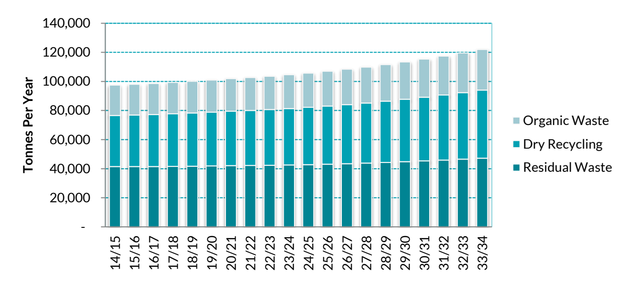
Figure 1: Figure 4.1: Projected Household Waste Arisings 2014-34

4.18. Based upon current waste arisings per head of population and the predicted population increase, Figure 4.1 shows that the quantity of household waste produced is projected to increase by 29% per annum by 2034, from 97,300 to 125,200 tonnes per annum. There is an aspiration to increase the recycling rate (dry and organic waste) from the current rate of 54% to 77%, meaning that residual waste is anticipated to grow at a much lower rate of only 12% by 2034.