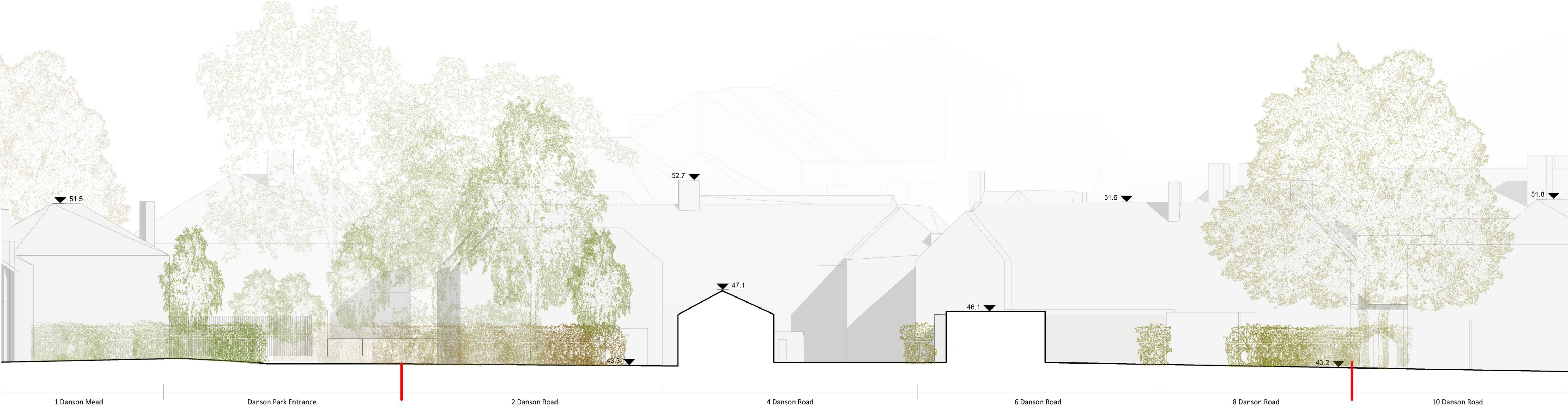
B - Existing West Elevation 1 : 100