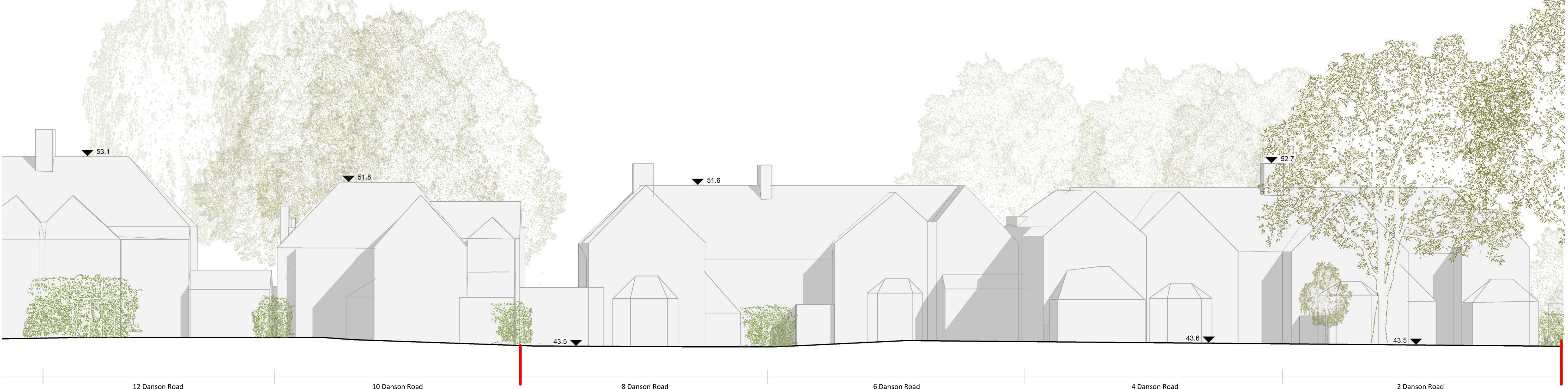
D - Existing East Elevation 1 : 100