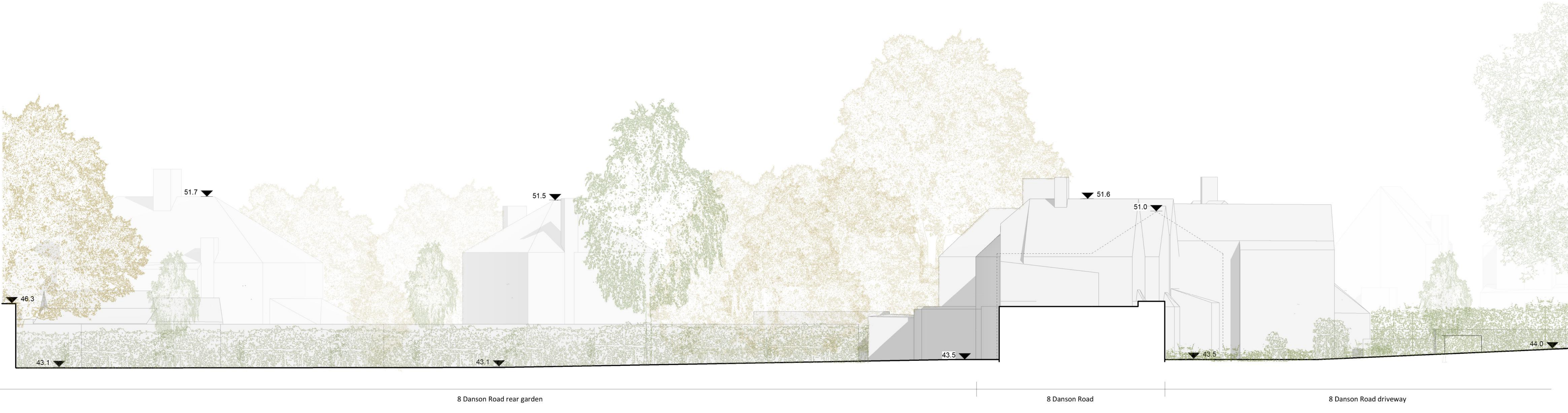
A - Existing South Elevation 1 : 100

The use of this data by the recipient acts as an agreement of the following statements: Do not use this data if you do not agree with any of the following statements: All drawings are based upon information supplied by third parties and as such their accuracy cannot be guaranteed. All features are approximate and subject to clarification by a detailed topographical survey, statutory services enquiries and confirmation of the local authorities. The unprinted version of this drawing should be viewed in DWG or PDF format not DWG or other formats. All prints of this drawing must be made in full colour. Where this drawing has been based upon Ordnance Survey data, it has been reproduced under the terms of Public License No. 100000144. Reproduction of this drawing in whole or in part is prohibited without the prior permission of Ordnance Survey. Do not scale the drawing. Use figured dimensions in all cases. Check all dimensions on site. Report any discrepancies in writing to Ryder before proceeding. Scale Bar (m)