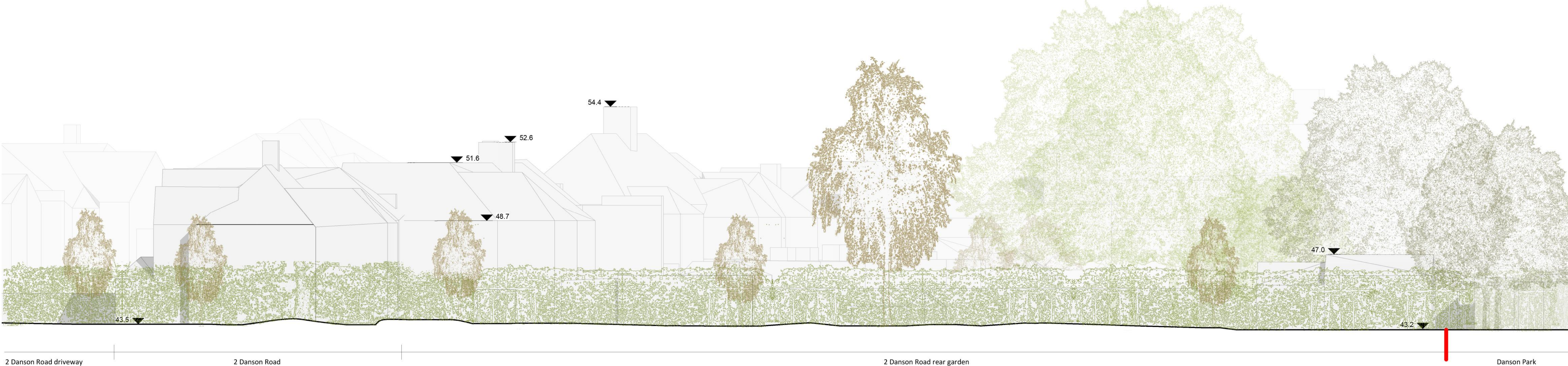
C - Existing North Elevation 1 : 100